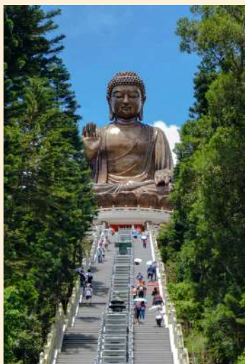
Tian Tan Buddha