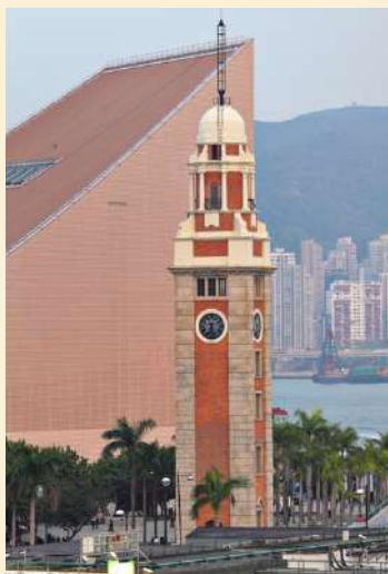
Clock Tower in Tsim Sha Tsui