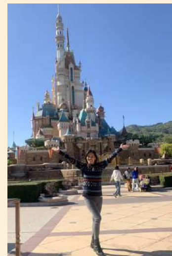
Hong Kong Disneyland