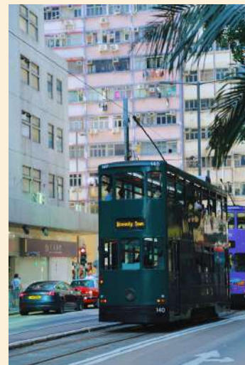
Kennedy Town Tram Terminus