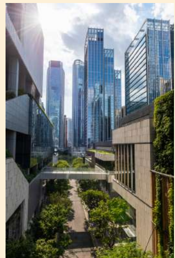
Shenzhen Greater Bay Area