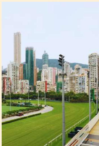
Happy Valley Racecourse