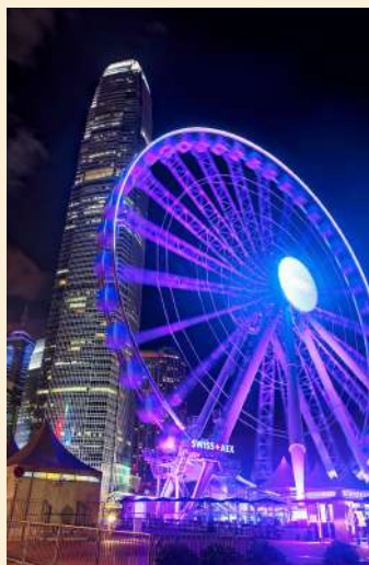
Hong Kong Observation Wheel