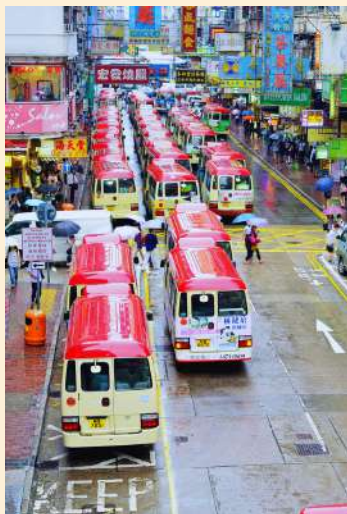
Mong Kok District