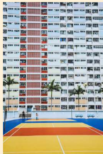
Choi Hung "Rainbow" Estate